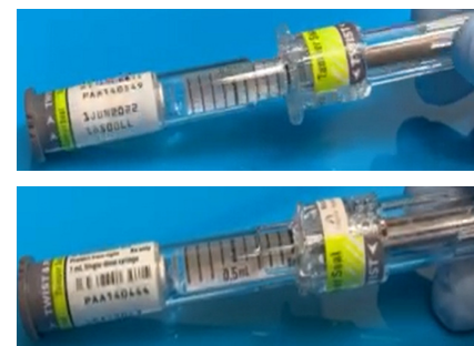
Figure 2. NexJect morphine 2 mg/mL (top) and HYDRO morphine 1 mg/mL (bottom) syringes look similar when the principal display panels are turned from view.