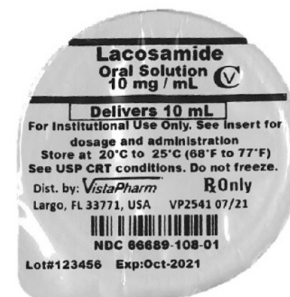
Figure 1. The 50 mg (top) and 100 mg (bottom) unit dose cups of lacosamide (VistaPharm) are both labeled prominently as 10 mg/mL, which could lead practitioners to misidentify the total amount of drug in each cup.

that information is separated from the concentration and may be missed. Unfortunately, there is no labeling standard that requires the total dose to be expressed on each oral liquid unit dose cup. There should be, and we have contacted the US Food and Drug Administration to look into this. We have also contacted VistaPharm to request a labeling change to reflect the total amount of drug in each container. The hospital that