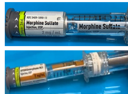
Figure 1. Primary display panels on NexJect morphine 2 mg/mL (top) and HYDRO morphine 1 mg/mL (bottom) syringes.

On the NexJect syringes, the morphine 2 mg/mL strength is printed on a white background. The HYDRO morphine 1 mg/mL strength is printed on an orange background ( Figure 1 ). However, both syringes have