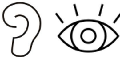
Figure 3. Examples of standard graphics that manufacturers can use on cartons and container labels to visually portray use in the ear (left) or the eye (right).

Administration. When possible, schedule ear drops and eye drops to be administered on different schedules (e.g., if given once daily). In long-term care facilities, use barcode scanning before administration and confirm the medication, route, and indication with the patient before administering ear drops or eye drops. Immediately dispose of any discontinued product.