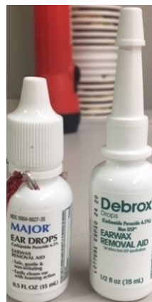
Figure 1. Carbamide peroxide 6.5% ear drops by Major Pharmaceuticals (left) is packaged in a dropper bottle similar in size and shape to an eye drop container. DEBROX by Prestige Consumer Healthcare has a long neck for otic administration and the label states “EARWAX REMOVAL AID” in large font (right).

A prescriber ordered two eye drops and one ear drop, carbamide peroxide (for earwax accumulation), for a patient. The patient’s nurse utilized barcode scanning to verify the medications were correct. However, the nurse administered all drops via the ophthalmic route. The nurse was used to carbamide peroxide being dispensed in a bottle with a long neck, making it obvious that it was an otic formulation. However, this time it was dispensed in a bottle resembling an ophthalmic container (Figure 1).