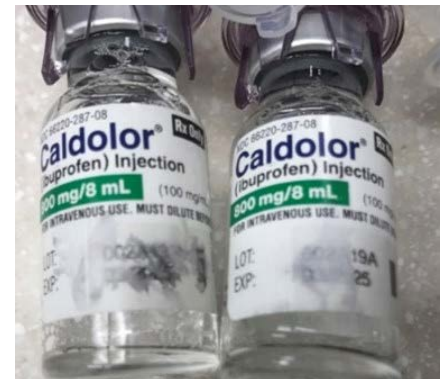
Figure 1. Alcohol-smeared label information on Cumberland Pharmaceuticals' CALDOLOR (ibuprofen) injection vials.

Over the years, we have received several reports in which certain inks on labels of injectable medications were smeared or removed when wiped with disinfectant products. Most often the expiration dates and lot numbers were smeared or removed when the vials were wiped with alcohol prior to being brought into a sterile environment ( Figures 1, 2, and 3 [on page 2]). This may contribute to staff unknowingly preparing a dose from an expired vial or not being able to identify a lot number for documentation after preparing the drug. In some cases, if the expiration date and lot number cannot be confirmed, the medication may need to be discarded.