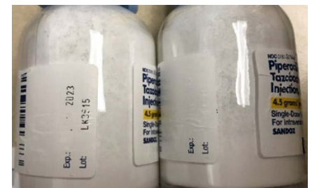
Figure 2. Pharmacy staff were unable to confirm alcohol-smeared expiration date and lot number on Sandoz's piperacillin-tazobactam vials.

We have contacted the US Food and Drug Administration (FDA) to recommend that manufacturers evaluate the ink used on their products to ensure label information will not