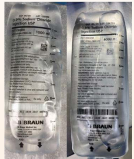
Figure 2. B. Braun changed the linear barcode on the 0.9% sodium chloride injection 1,000 mL bag (NDC 00264-7800-09) from white (left) to black (right) in 2020, but practitioners still report issues with scanning.

ISMP has also received reports about the inability to scan the linear barcodes on some of B. Braun's large volume parenteral (LVP) bags ( Figure 2 ) and minibags ( Figure 3 ). The most frequently reported concern is difficulty scanning a white barcode printed on a clear bag. Practitioners state that the white barcodes are especially difficult to scan