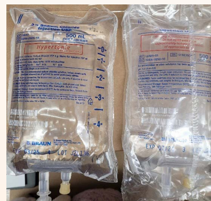
Figure 1. B. Braun's 500 mL bags of 3% sodium chloride injection (hypertonic) (left) and sterile water for injection (right) look similar and have been mixed up.

Recently, three close call events have been reported in which look-alike B. Braun 500 mL bags of 3% sodium chloride injection (hypertonic) (NDC 00264-7805-10) and sterile water for injection (NDC 00264-7850-10) were misidentified. Both bag labels use the same bold blue font for the drug name ( Figure 1 ). The labels also display a red warning box below the name. While one includes text stating "hypertonic," and the other has a warning about it being hypotonic and hemolytic, these bags can easily be confused.