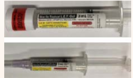
Figure 1. When practitioners remove the cap (top) from the topical lidocaine, EPINEPHrine, and tetracaine gel by Fagron, they can attach a needle to the parenteral syringe (bottom) or connect the syringe to an IV set.

recommend using) gel in a parenteral syringe ( Figure 1 ). While it has a warning in small font on the syringe barrel, “TOPICAL USE ONLY,” and a larger warning on the cap, “FOR EXTERNAL USE ONLY,” practitioners may miss these warnings after removing the cap. We previously wrote about an error in which a nurse administered a topical medication into a patient’s gastrostomy tube (G-tube) ( www.ismp.org/node/32726 ).