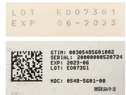
Figure 1. Lot number in the top label appears to be E0073G1. The bottom label clarifies the lot number, listing the letter O followed by the number zero with a slash mark through it.

All about the slashed zero glyphs. Hospital pharmacy staff noticed a discrepancy with the lot numbers they were entering when repackaging enoxaparin injection by Amphastar Pharmaceuticals. The lot number imprinted on one label appeared to read “E0073G1,” with two zeros after the letter “E.” At the same time, another enoxaparin injection label from the same manufacturer clearly read, “E0073G1,” revealing that what was thought to be the number zero was actually the letter O, while to the right of that was actually the number zero (Figure 1). This